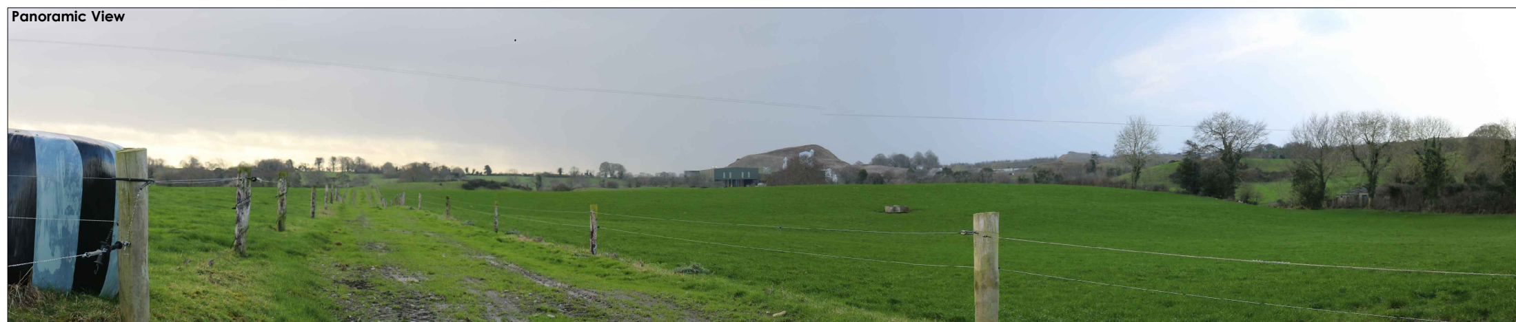
Viewpoint 3 South from L80141. View South from minor road L80141 less than 1km from the subject site. From this open section of road the existing temporary overburden is clearly visible, however areas of proposed extraction would not be visible due to a combination of intervening vegetation, buildings and topography.